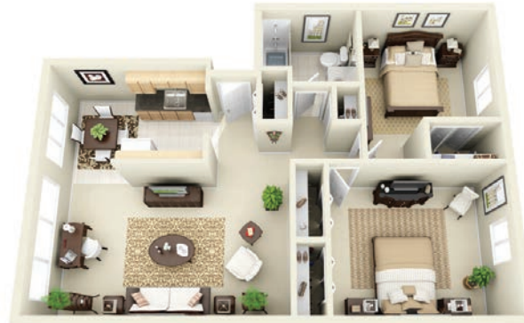
The Garden – Two Bedroom, One Bathroom 800 sq ft $ _____