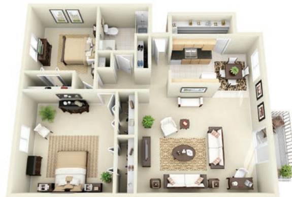
The Clover – Two Bedroom, One Bathroom 1,000 sq ft, with balcony $ _____