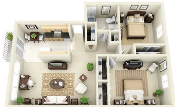
The Park – Two Bedroom, One Bathroom 800 sq ft, with balcony $ _____